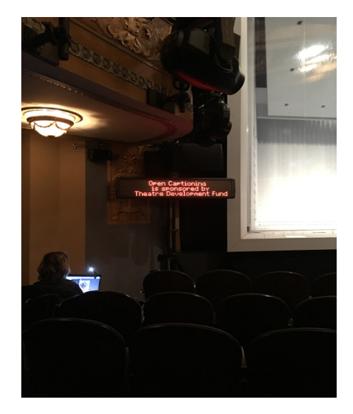
Example of LED Board on Tripod