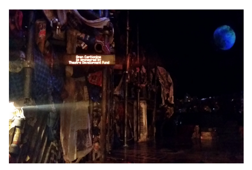
Example of LED Board being hung using the slidable hooks