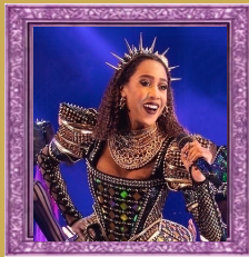
CATHERINE OF ARAGON DIVORCED