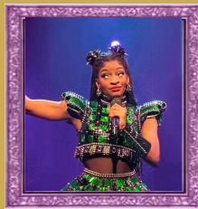
ANNE BOLEYN BEHEADED