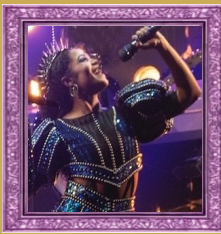
CATHERINE PARR SURVIVED

DIVORCED-BEHEADED-DIED-DIVORCED-BEHEADED-SURVIVED