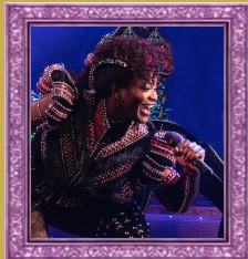
ANNA OF CLEVES DIVORCED