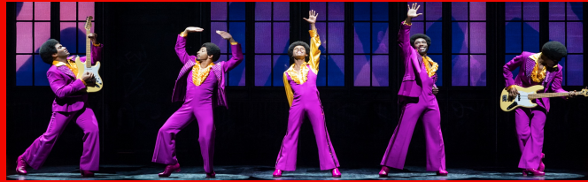
The Jackson 5/The Jacksons: Tito, Jackie, Jermaine, Marlon, Randy, Michael