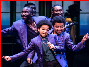
Little Michael performing with his siblings in The Jackson 5

SYNOPSIS: This story does not unfold in chronological order. It begins with Michael Jackson (MJ) at age 34 in the rehearsal process. He guides the audience through memories over his career.